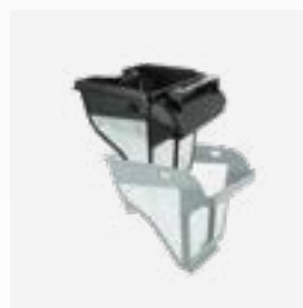
Filter canister Dual stage filter: 150/60 μ