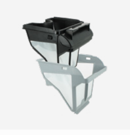
Filter canister Dual stage filter: 150/60 µ