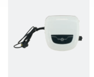
Control unit Filter