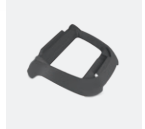
Base For control unit